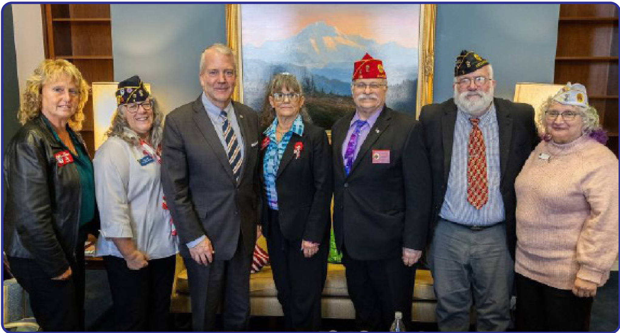
In Washington D.C. with Senator Dan Sullivan