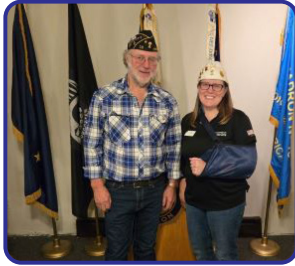
Visiting Alaska Posts and having a party while doing it!