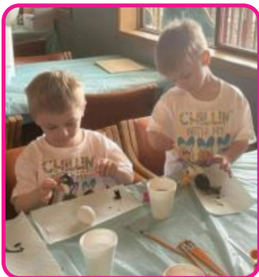
Post 15 has many talent artist helping the Easter Bunny