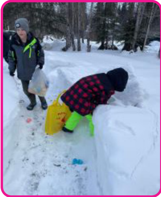
Post 30 had over 60 families come out and enjoy the Easter egg hunt. The Easter bunny was overjoyed!