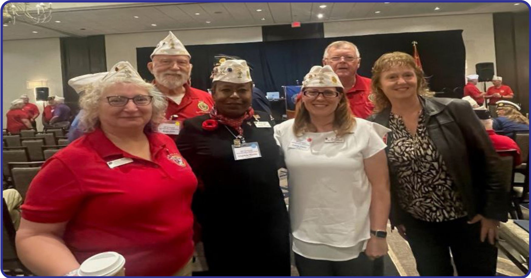
The Department of Alaska officers attending National Membership training in Indianapolis. (looks like some shifty characters photo bombed us)