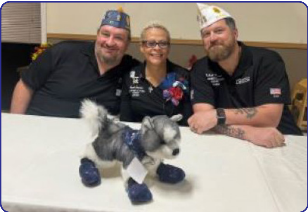
SUSITNA VALLEY POST 35 WASILLA