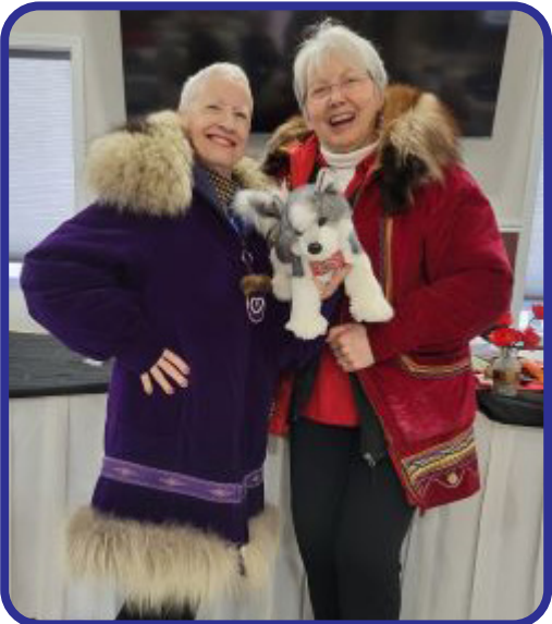
National Western President***** with Unit 1 president****. Modeling parka's at the Fall Conference