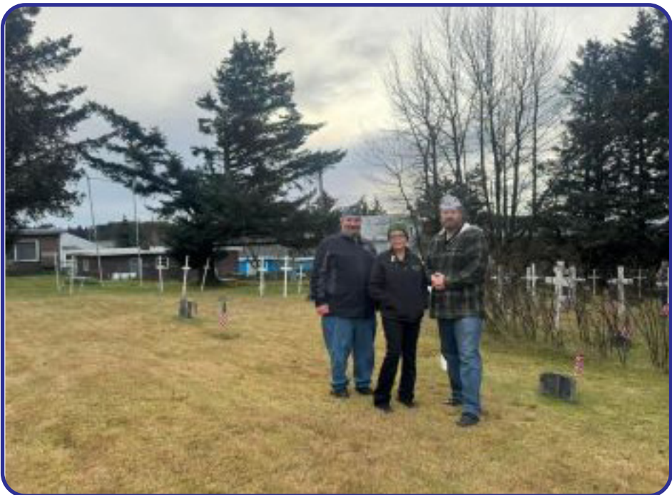
ROBERT BLAIR POST 17 KODIAK