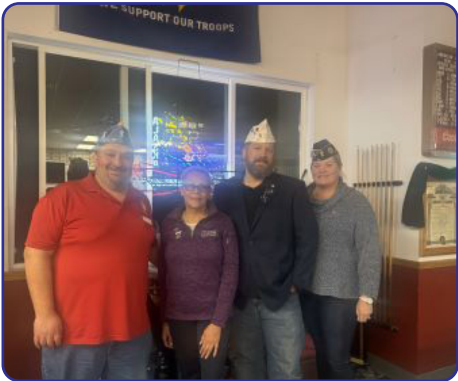
PETERS CREEK POST 33