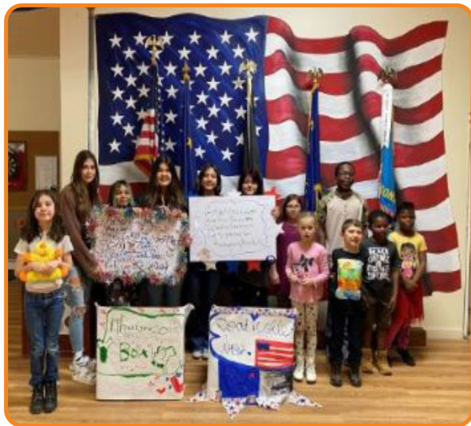
Post 35 Jr. Auxiliary taking care of business. Writing Christmas cards to send to our Troops overseas. They are also making collection boxes for winter clothing to help families in need. What an incredible group of kids!