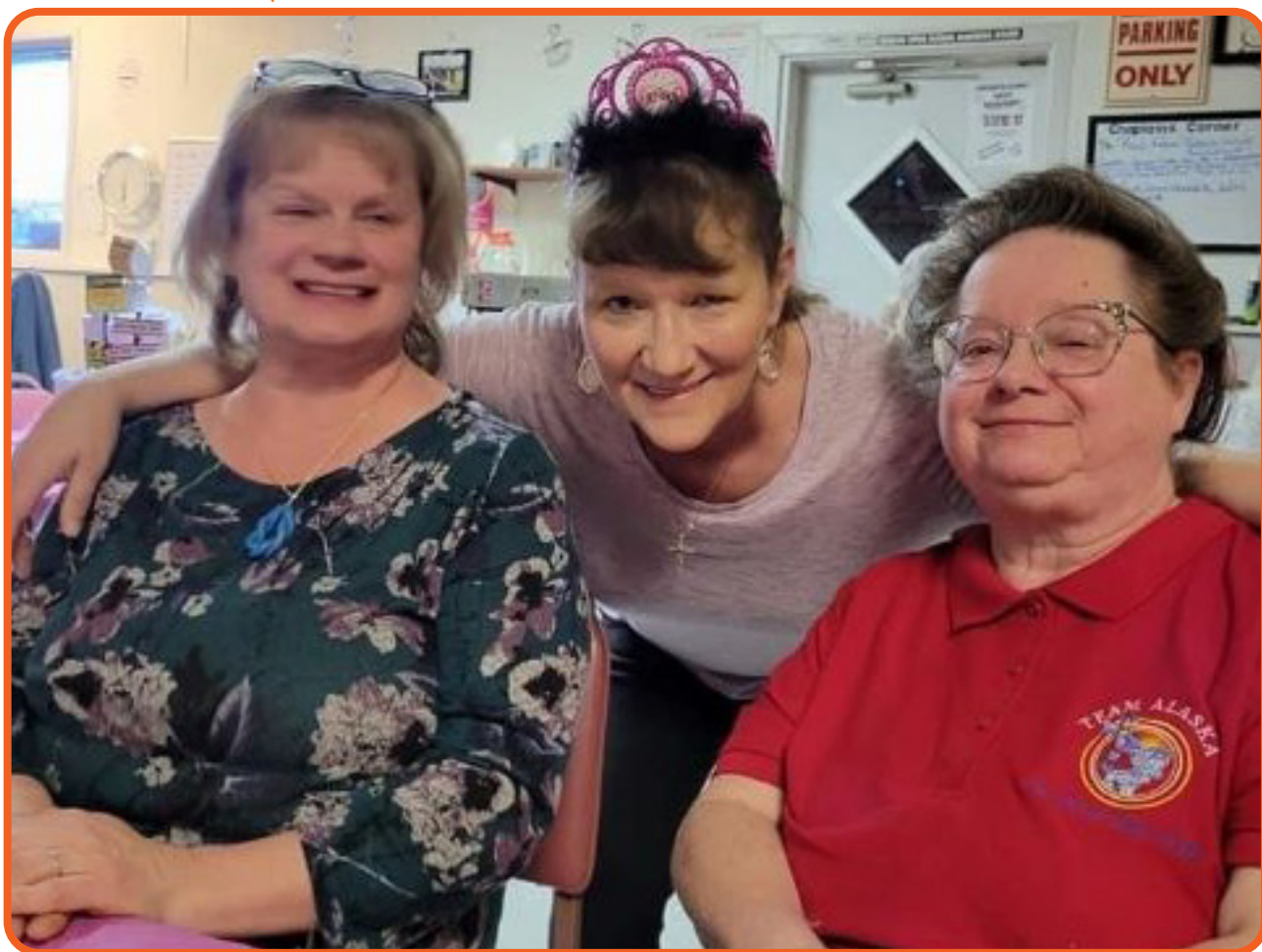
Sister's, Sister's, There were never such devoted sister