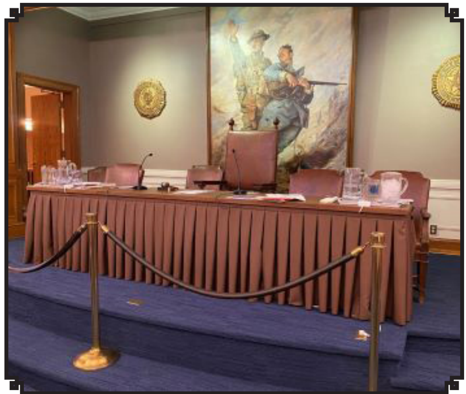
The National Commander and the four National Vice Commander's watch over the National Executive Committeemen

All 55 Departments have one National Executive Committeemen and one Alternate National Executive Committeemen. They all meet in this beautiful room.