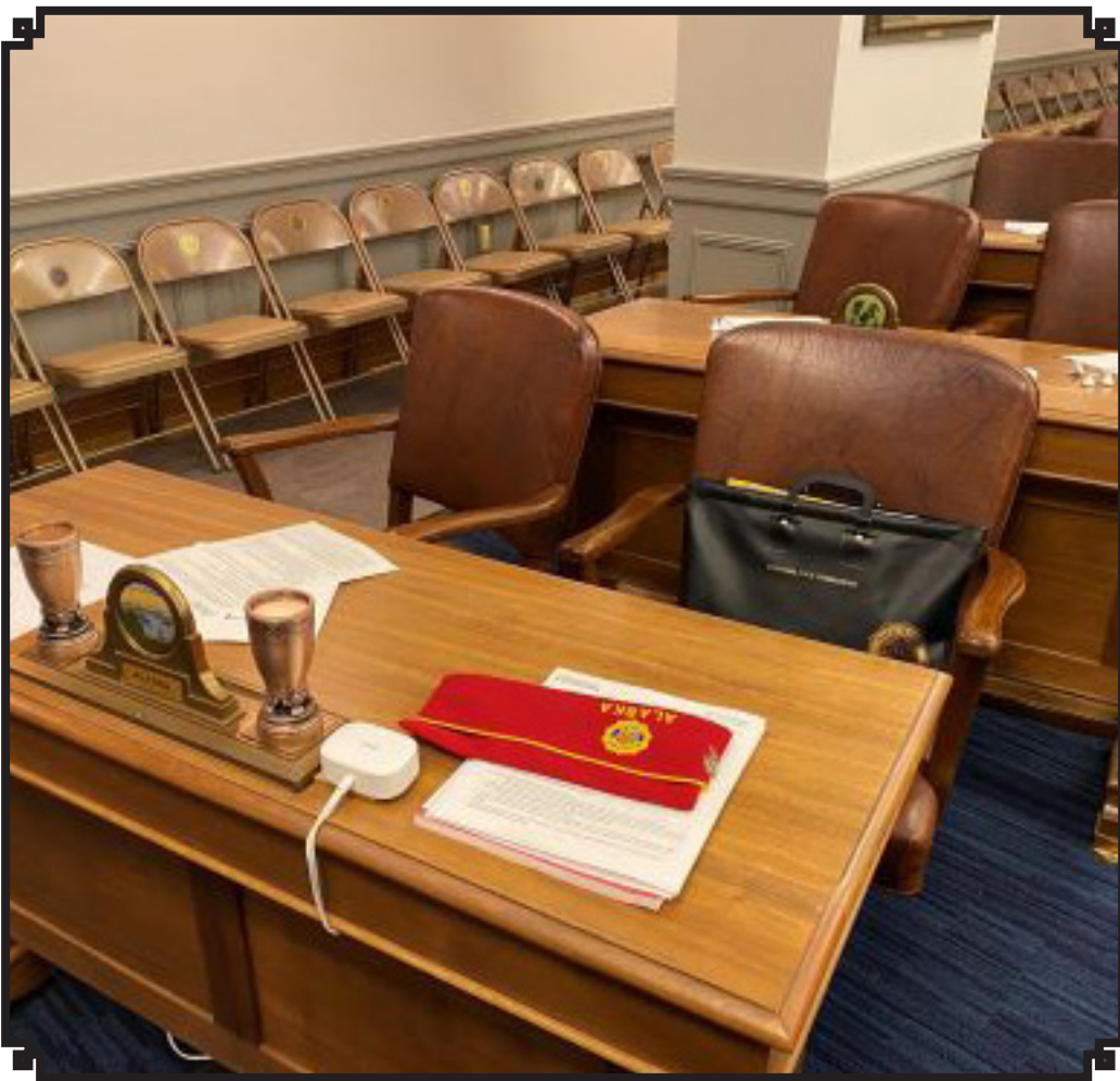
This is the Alaskan National Executive Committeemen desk.

All 55 Departments have one National Executive Committeemen and one Alternate National Executive Committeemen. They all meet in this beautiful room.