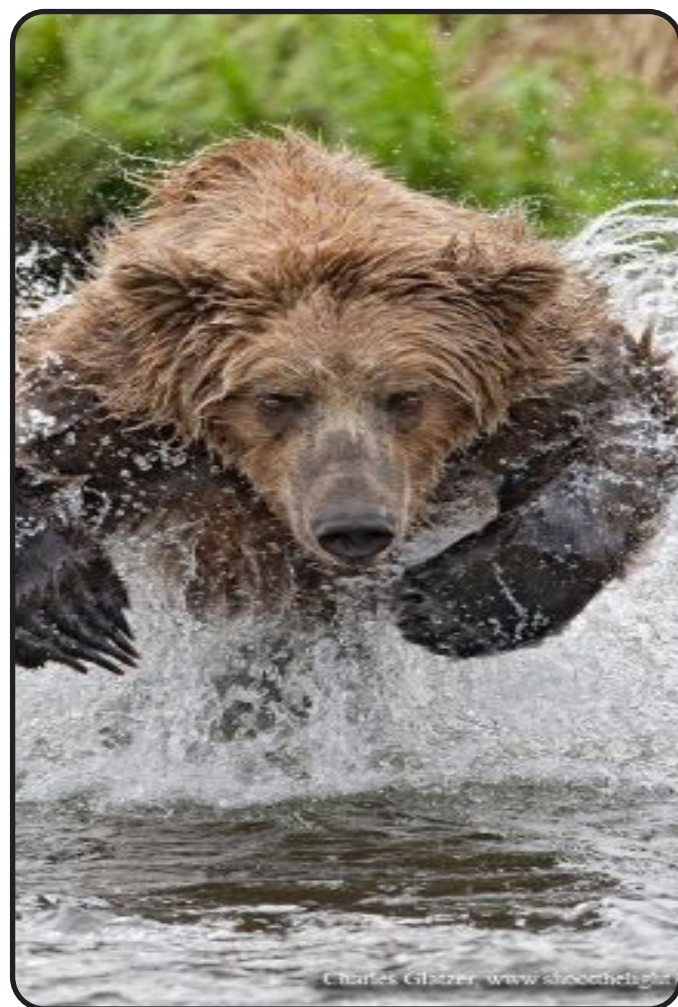
This is a bear A big mad bear